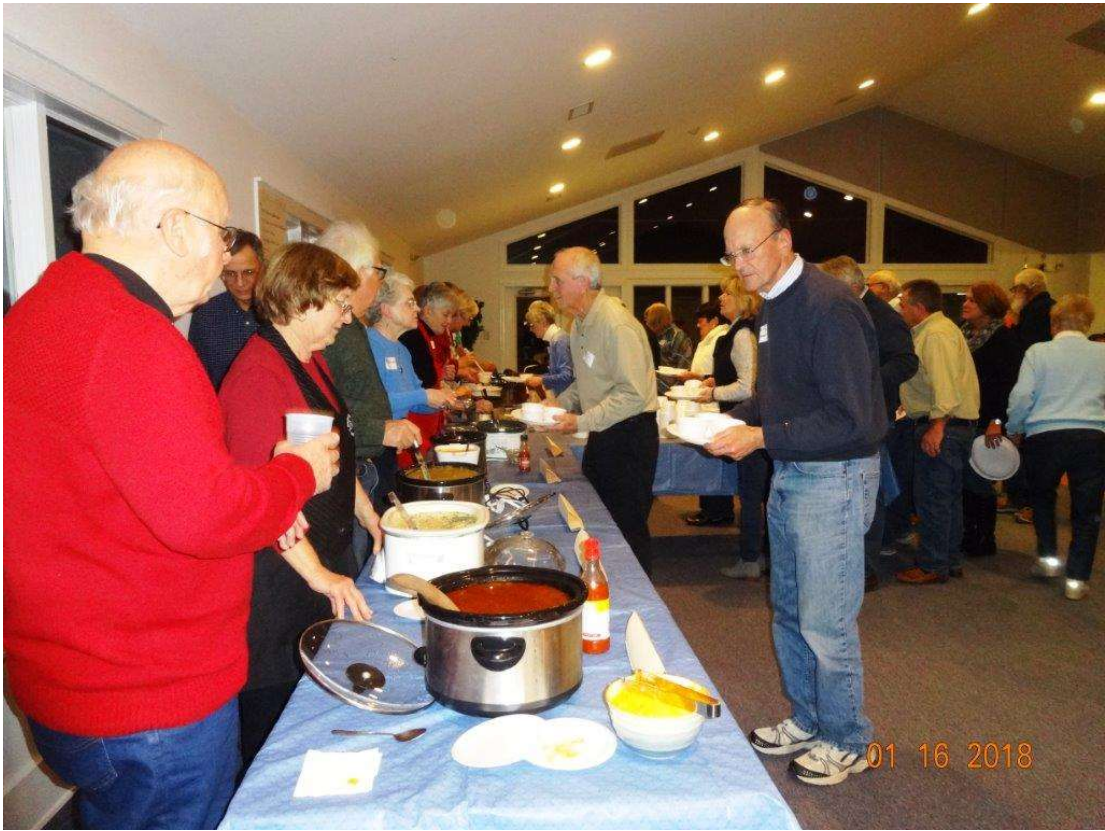
Soup Supper attendees enjoying the offering