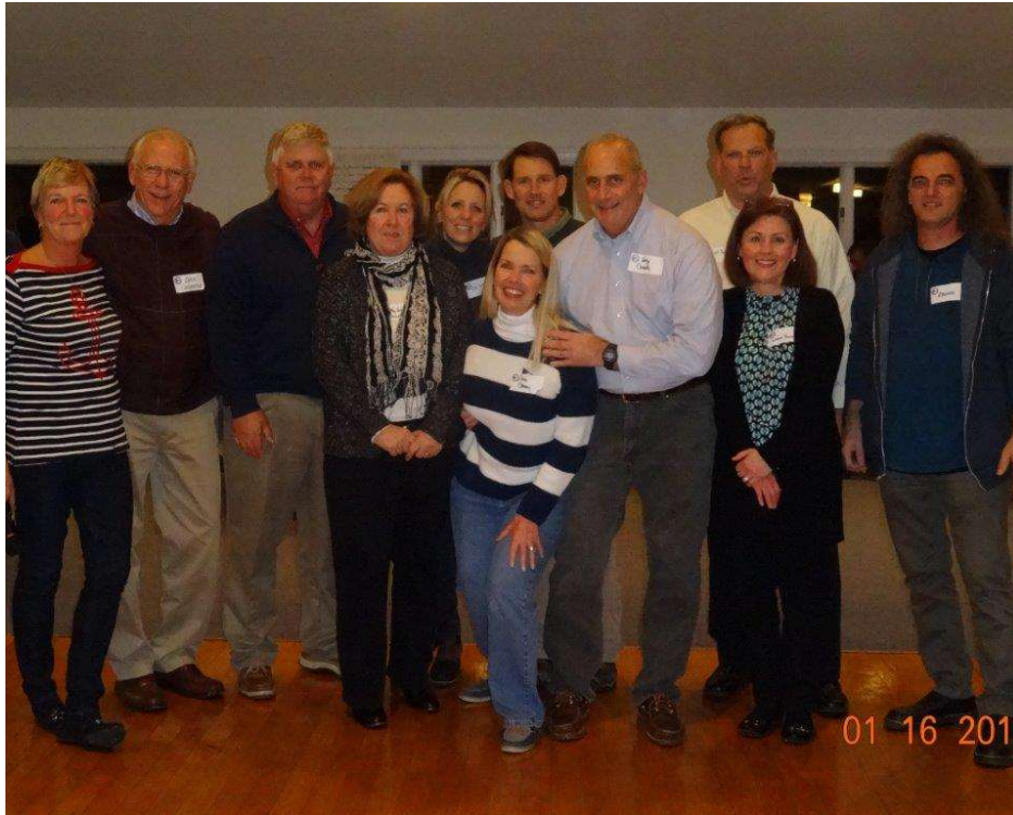
New SYC 2017 Members